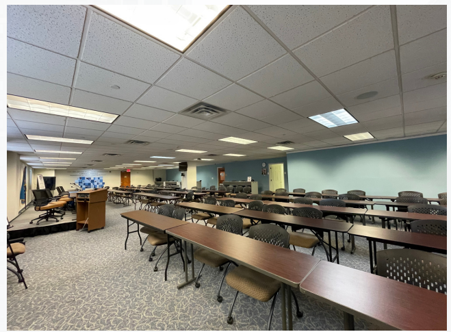
The Honorable Kathleen M. Miller Room