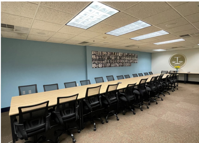
Joshua W. Martin Room