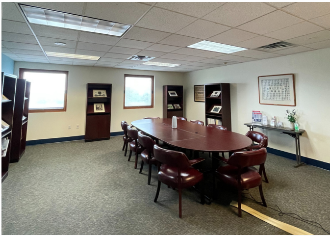
Josiah Marvel Room